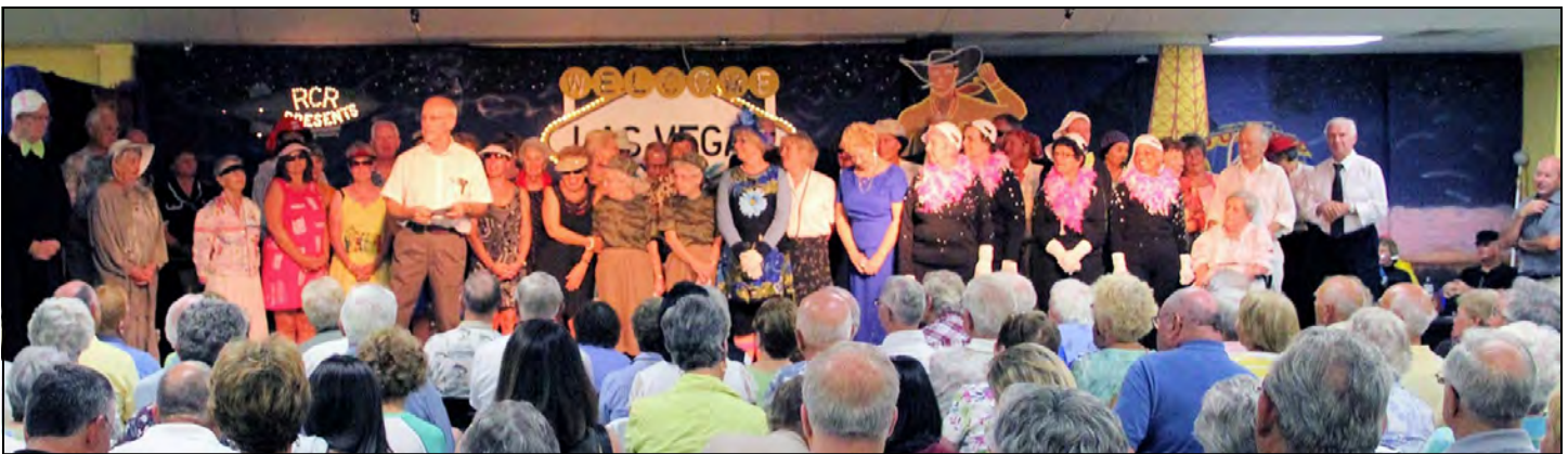
The audience cheered as the cast filled the stage at the finale.