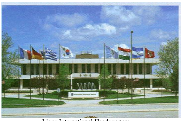
Lions International Headquarters